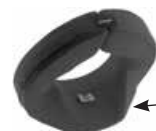
Below: OMP Anatomical Neck Collar Part No. 2123-Color

The anatomical shape extends down between the shoulders for additional support