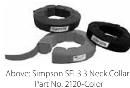
Above: Simpson SFI 3.3 Neck Collars Part No. 2120-Color