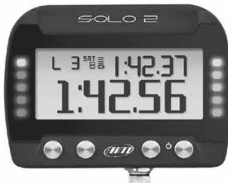
AiM Solo2 Lap Timer (stand-alone version) Part No. MC-670

If your chosen track does not have a map in GPS Manager, you can create one by running (or even walking) a single lap with the Solo2. As you go around the track, the Solo2 will record your position 10 times a second (using powerful algorithms and other data to fill in the gaps between). Download the lap to Race Studio, and GPS Manager will let you import the track shape that was recorded on that lap. You can now use that track map on your SmartyCam's video overlay!