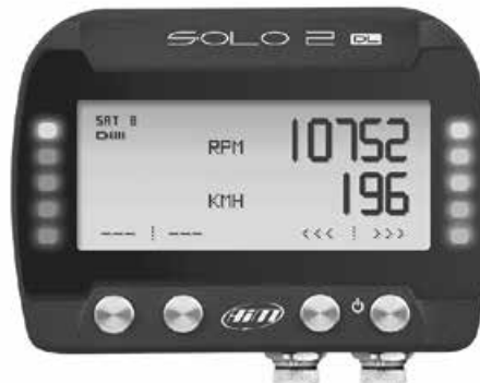
AiM Solo2 DL Lap Timer / Data Logger Part No. MC-671 / MC-672 / MC-673

Suction Cup Mount for temporary windshield mounting .....Part No. MC-573 ..... $35.99 Replacement Mounting Bracket only .....Part No. MC-674 ..... $14.99 This is the "data box mount" required by SCCA in many competition-balanced classes.