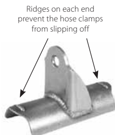
Above: Floating Saddle Mount Part No. 1825-100-Size